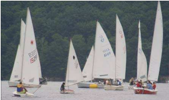
MSC Learn To Race participants rounding a mark