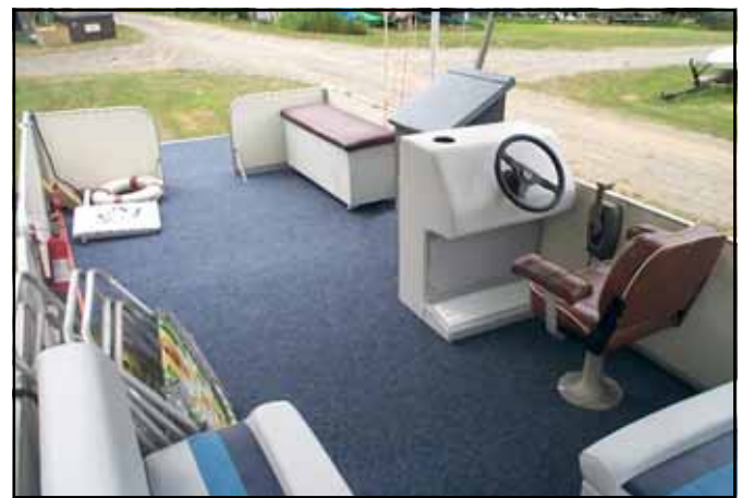
The committee boat also got new seats, a new steering console, and other related mechanical parts. The motor was also repaired.