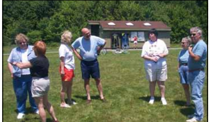
A number of people just hang out in the warm sun after the great CSP picnic.