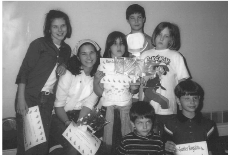
YOUTH PARTICIPANTS AT SPRING FLING