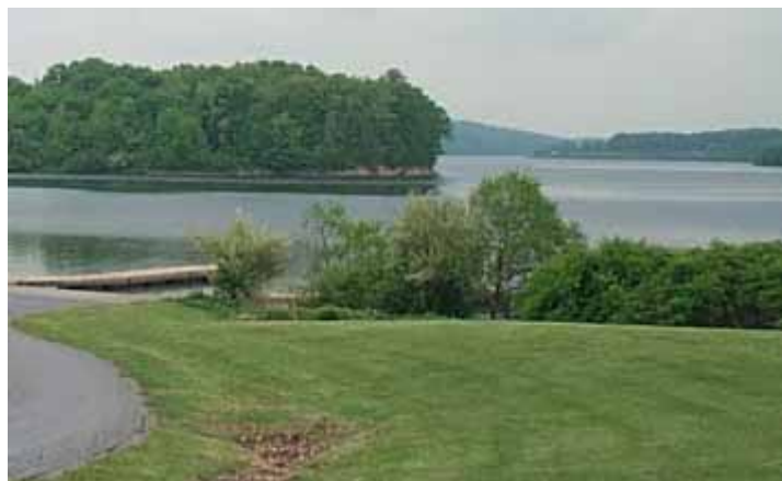
General Area for the New Storage Shed at Watts Bay