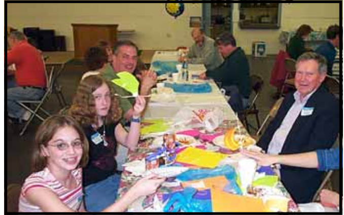
We had plenty of materials to build boats