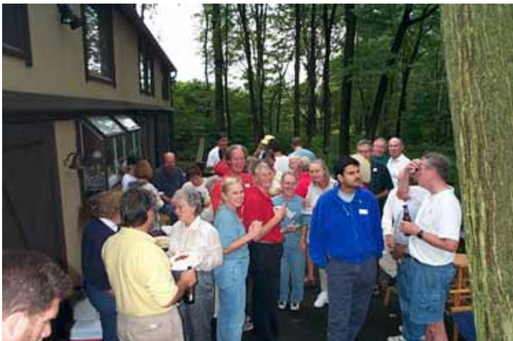
The Saturday Evening Affair at the House was a Great Success