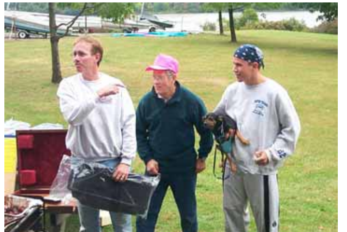
Yes, the Dog was Handling the Spinnaker Sheets